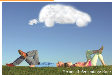
*Annual Percentage Rate

Paying too much for your existing car loan? Ask about our low refinance rates Rates are subject to change without notice.