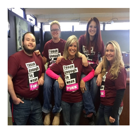
Tough Enough to Wear Pink 2016