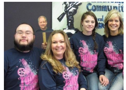
Tough Enough to Wear Pink 2015